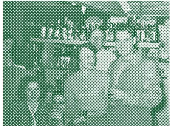
RANGER STATION #925 "HAPPY HOUR FOLLOWING A DAY'S HIKE" C. 1982

"Wouldn't it be great if people could get to live suddenly as often as they die suddenly?" To live unusually - suddenly! - is a small but worthwhile rebellion against life's contradictions. This cocktail is a flavorful exploration of sudden living. Swing big. Order the banh mi daiquiri. Be as unpredictable as the natural world.