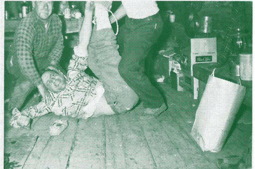
RANGER STATION #925 C. 1982 "FUN AT THE HUNTING CAMP"